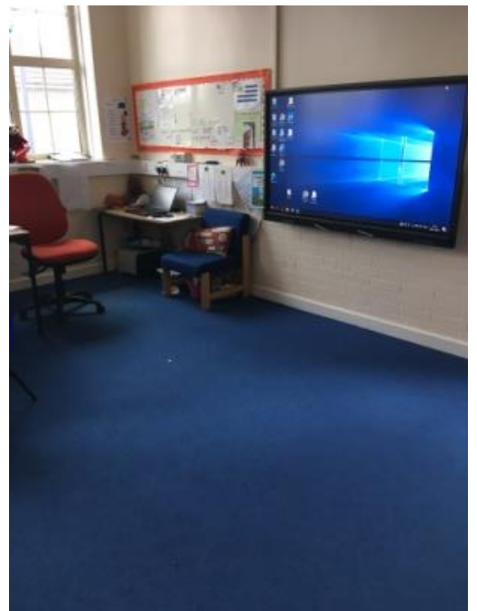
This is Tamarin Class