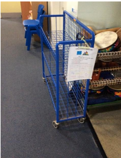
Tiger Class' trolley