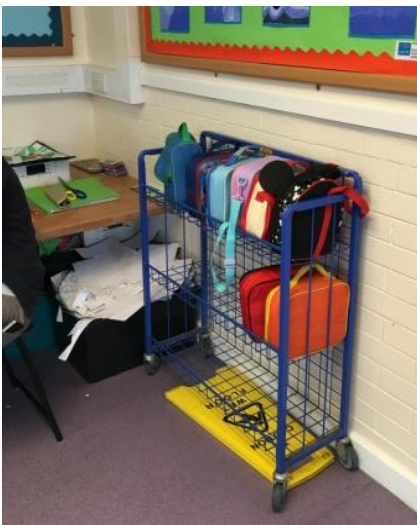
Tamarin Class' trolley