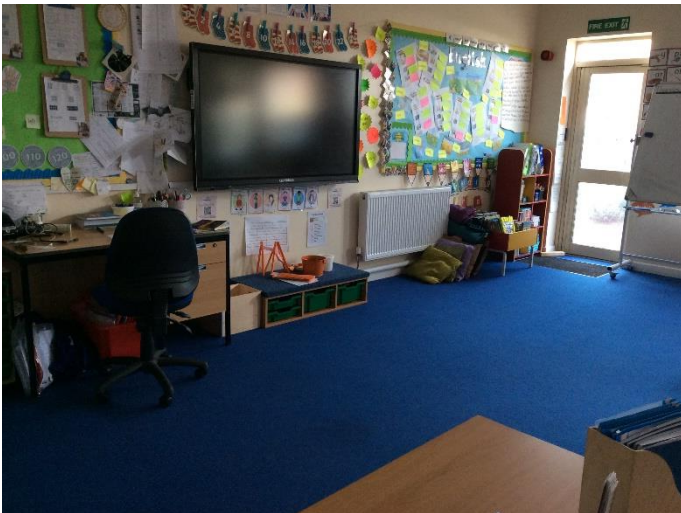
This is Tiger Class