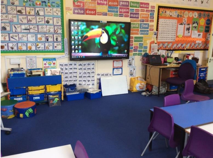
This is Toucan Class

In the morning, I will come into my classroom and sit on the carpet