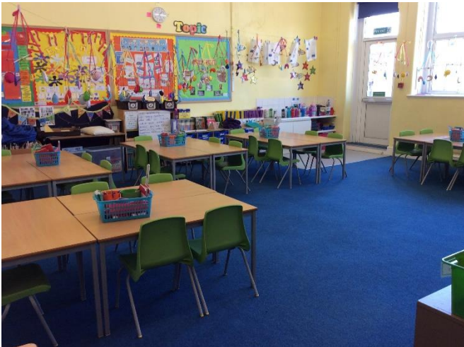
This is Tawny Owl Class.