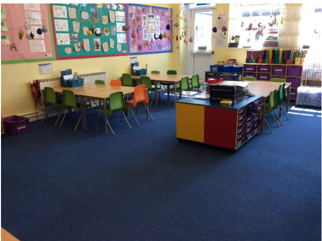
This is Turtle Class.