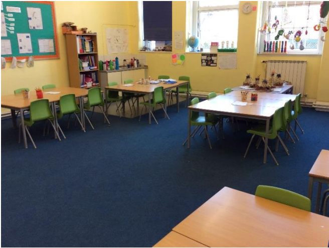
This is Treefrog Class.